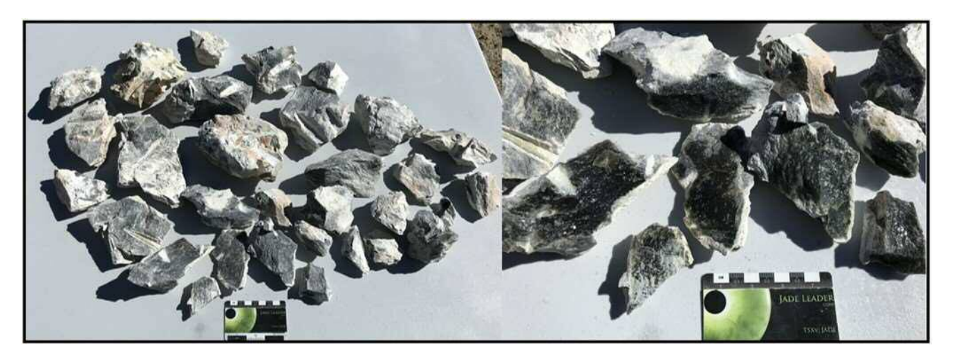
Figure 4: Large Gem and finer grained Jades, 11.2 kg (left), and detail, shown wet on the right.