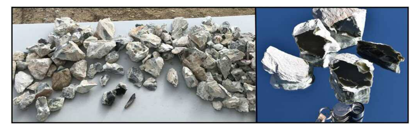
Figure 3: Hand size gem jades, 48.1 Kg (left), with select pieces partially polished on the right.

In order to generate an accurate determination of the volume of material extracted and provide the basis for measuring the recovered yields of gem Jade materials per unit volume or tonne, a high resolution drone survey was conducted before and after field activities by a US based independent third part mining consultancy firm to accurately measure the area tested by comparative photogrammetry.