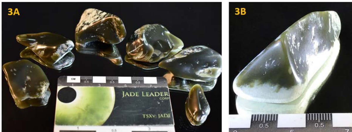
Figure 3: Representative Sky Jades cleaned of their alteration rinds by tumbling, and ready to use for carving, jewelry pieces, lapidary use, or specimens. 3A: SKJTG 2001-2006, total 128 grams, 3B: SKJTG 2000, 41.8 grams.