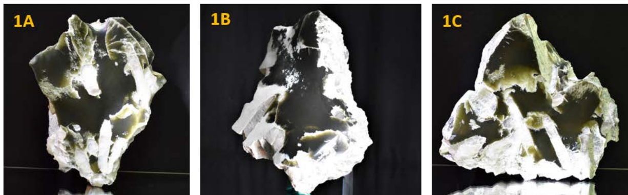
Figure 1: Curated Sky Jade and Quartz crystal mineral specimens. 2A: SKJSP1, 1.156 Kg. 2B: SKJSP 3, 1.048 Kg. 2C: SKJSP2, 0.680 Kg.

Materials prepared, inventoried and photographed to date include specimens (3 stones, 2.84 Kg), larger carving blocks (8 stones, 30.65 Kg), tumbled Jades (20 stones, 1.25 Kg) and hand size gem Jade (14 stones, 8.05 Kg). Samples of the results from this process are included below in Figures 1 to 4. Materials preparation remains ongoing.